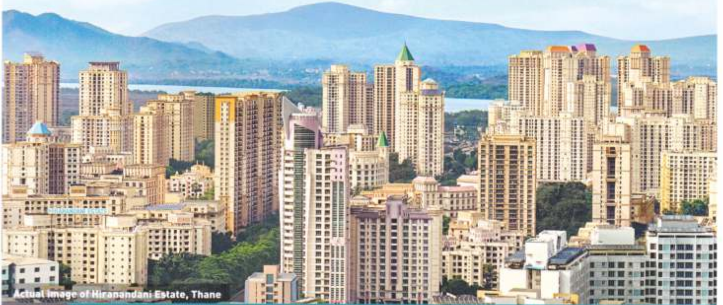
Actual image of Hiranandani Estate, Thane